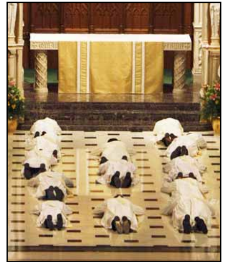
Above: Ordinands prostrate themselves

But how can ordinary human beings, with all their weaknesses and failings, be 'walking sacraments' of Christ? All ministry