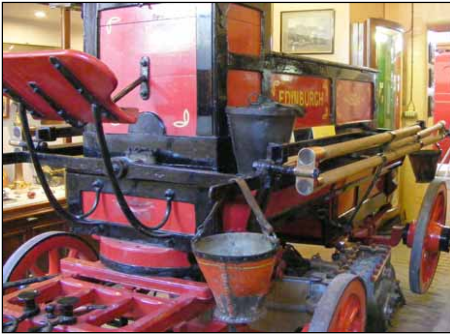
Left: The Museum of Fire in Lauriston Place Above: 1824 Fire Engine

white canvas trousers and leather belts with brass buckles. As is to be expected, uniforms progressed over the years and are also on display at the museum.