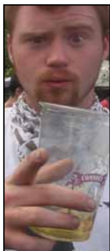
Above: It could be You ...

To find out more, visit their website: www.christianaid.org.uk/pilgrimage